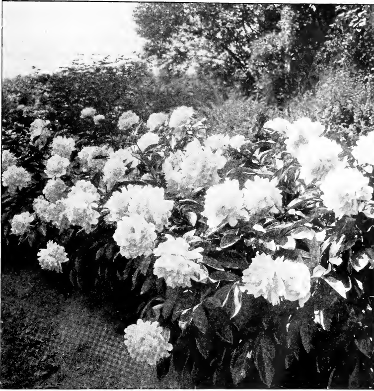
Festiva Maxima Peonies